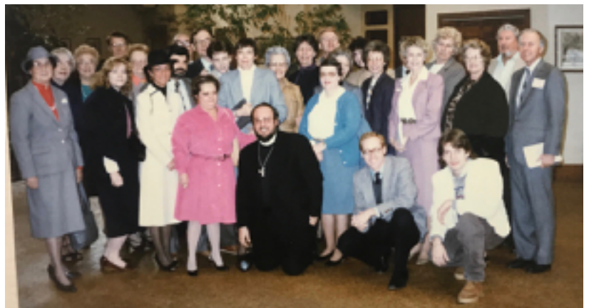
Williamsburg - February 1986